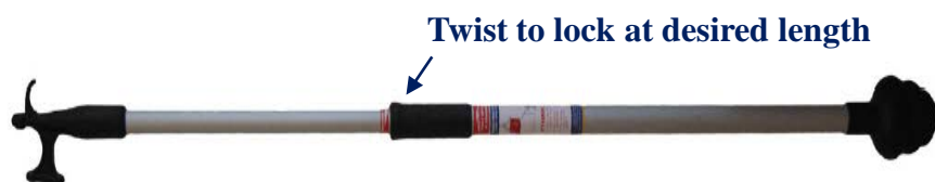
Fig b. Fully Extended for pulling (e.g retrieving taglines)

The rubber buffer is used to push against suspended loads to guide them, especially when landing loads in tight or congested spaces. Once again, this allows the operator to remain a safe distance from the load until it has landed. The poles would normally be fully retracted (for rigidity) during this type of use where their length is 1.2m / 4ft. However, they can be used half-extended if required but if too much pressure is applied, they will telescope in.