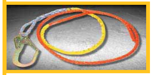
PSC-WEB-TLD125 = 25 ft. Tagline w/Snaphook