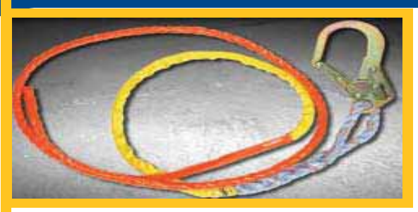
PSC-WEB-TLD120 = 20 ft. Tagline w/ Snaphook