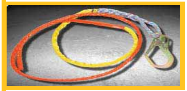
PSC-WEB-TLD130 = 30 ft. Tagline w/ Snaphook